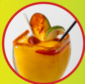
Mangonada Rita $13.75