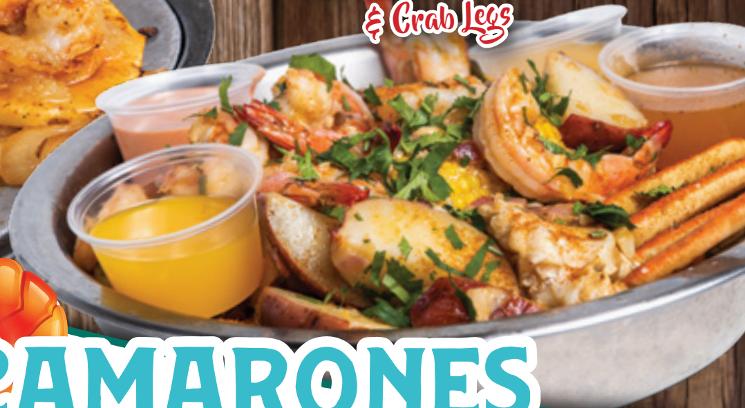
Flaco's Garlic Shrimp & Crab Legs