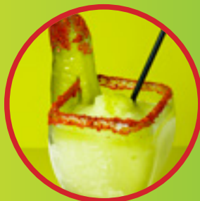
Pickle Rita $13.75