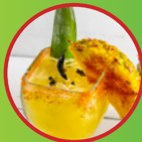
Pineapple Rita $13.75