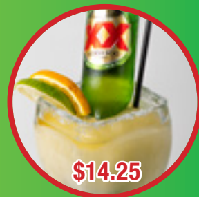
Beer Rita $14.50