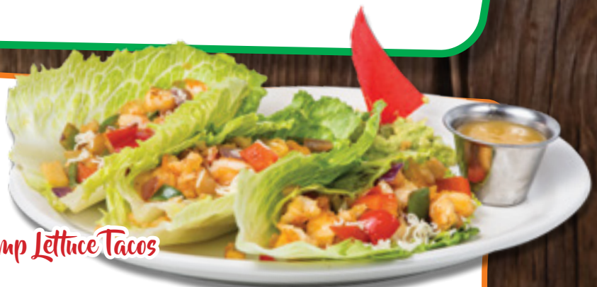
Shrimp Lettuce Tacos

Grilled chicken breast served with steamed spinach and served with sliced avocado, rice and pico de gallo. $12.99